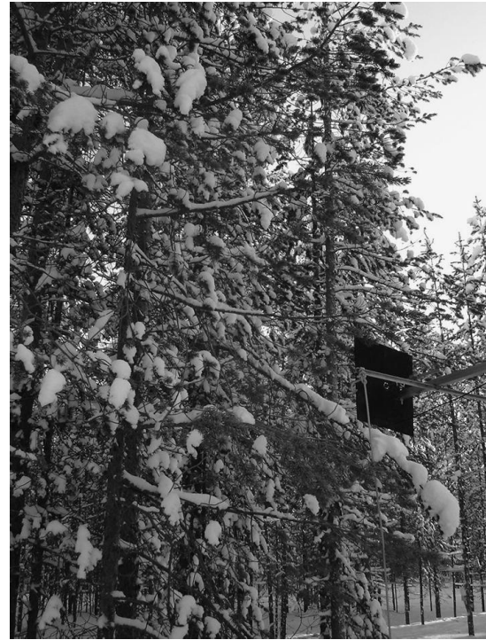
Fig. 3. The conditions of winter 2007 were those of heavy snow on the trees, low temperatures around -15 degrees C, and clear weather.

Since the measured albedo during the winter period was dominantly black-sky albedo, the geometry of the instrument set-up should be considered. As mentioned earlier, a 50 cm × 50 cm disk was used to shield the instrument from possible glares from the metal mast on which it was mounted. To achieve an accurate representation of the actual illumination conditions, one should also model the shadowing effect of the disk on the amount of radiation reaching the sensors. The task is made more difficult by the fact that only the reflected (upwelling) radiation is strongly affected. The incoming (downwelling) radiation is dominated by the Sun's direct radiation, which is always in the instrument's field of view during