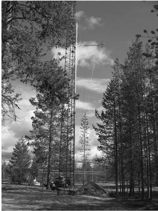
Fig. 1. The NorSEN mast at FMI-ARC with the vertical rail and CM-14 albedometer attached.

sunlight glinting from the metallic mast into the albedometer. The cover cuts out ca. 24% of the total viewing angle of 4\pi radians so that 12% of the upper and 12% of the lower hemisphere are covered. Its effect must be considered when analyzing clear weather (i.e. black-sky albedo) measurements. During fully cloudy weather, the illumination can be considered to be fully diffuse (i.e. white-sky albedo) and the cover's symmetric effect on the measurement can be considered negligible because it cut out equal proportions of the downwelling and the upwelling radiation.