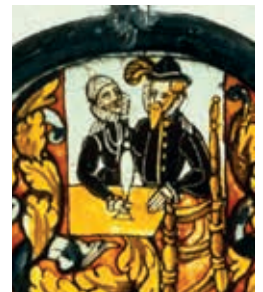
FIGURE 42. Master shoemaker Jesper Pedersen and wife dressed in black garments (detail of figure 34). Museum Odense.

In addition to cloaks, weapons were a mark of distinction connected strongly with wealth, civility, masculinity and aesthetic display. 110 However, since weapons were seen as increasing the risk of violence, swords were banned from the church and the guild house. 111 The statutes of the weavers' guild from 1630, furthermore, regulated that no journeyman could wear a sword on the streets. 112