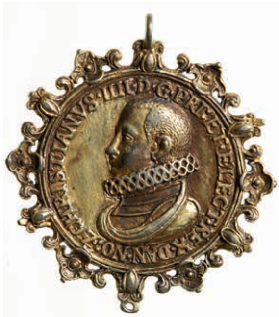
FIGURE 51. A gold medal pendant depicting Christian IV of Denmark, 1590.