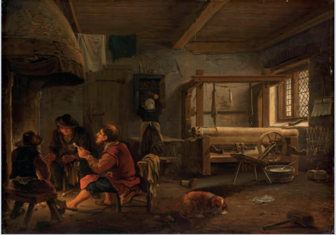
FIGURE 29. Dircksz van Oudenrogge, A Weavers Workshop , 1652. Oil on panel 41 x 56 cm. Rijksmuseum, Amsterdam.