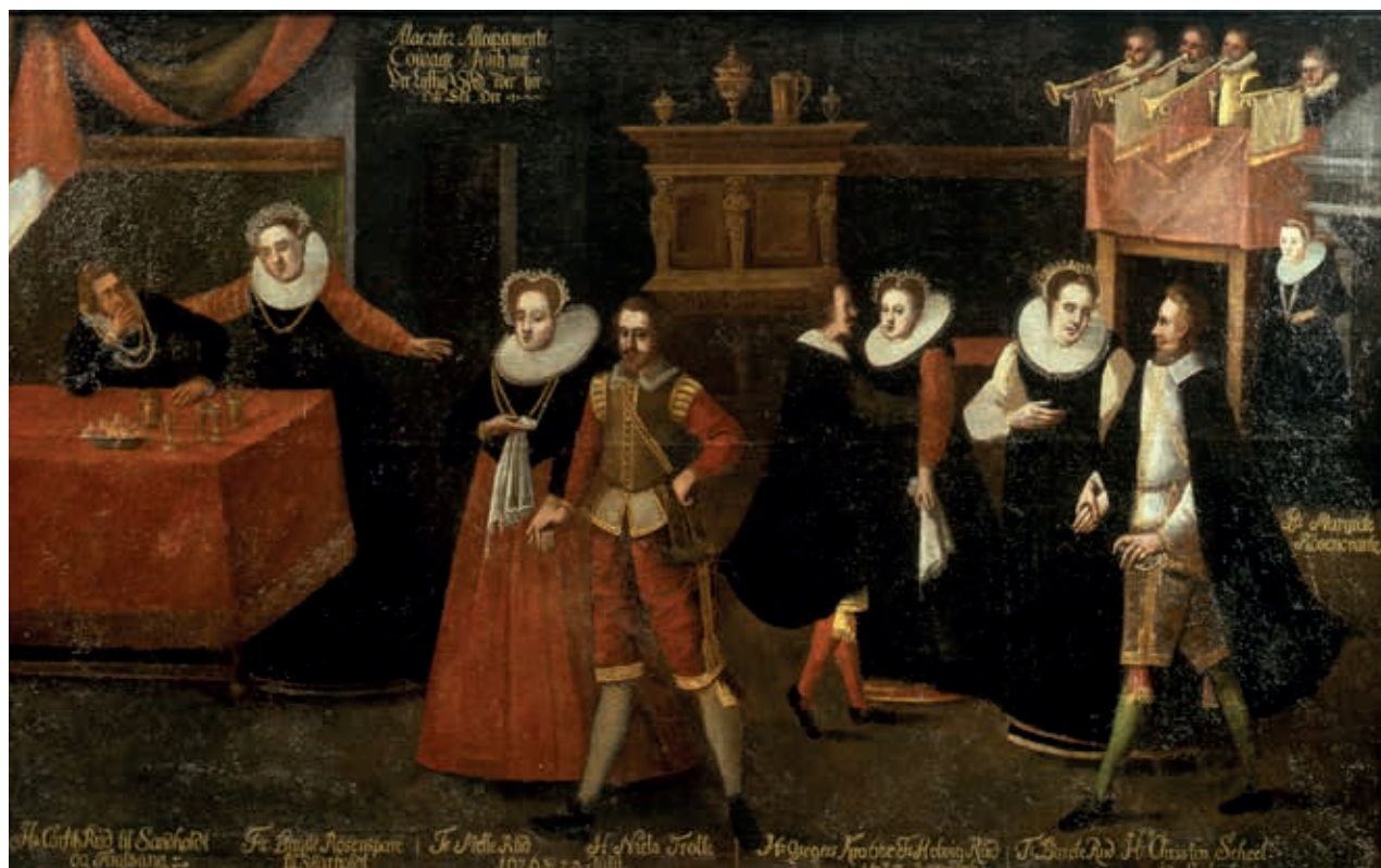
FIGURE 1. Remmert Pietersz (probably), Dansen hos Rud'erne , ca. 1630. Oil on canvas, 123,2 x 200,6 cm.

Visual images confirm the richness of Danish noble dress in the period. A painting from around 1630, probably portraying a wedding feast, depicts a group of noblemen and women dressed in garments made from colourful and rich fabrics (figure 1). The women wear red and black gowns with gold borders, fine metal head-pieces adorned with jewels and pearls and large ruffs edged with delicate lace points. Two of them carry fine linen handkerchiefs with lace edgings in their hands – a novel accessory in this period. 12 The young men are dressed in red, green and white gold-trimmed breeches, doublets and jerkins, and lustrous black overgarments, probably made of fine black wool. They wear ornamental sashes and colourful stockings tied with fringed garters. Their shirts are embellished with falling linen collars, some with delicate lace trimmings. While illustrating how the elite in Denmark dressed to show off power and affluence, the painting also reveals how they incorporated some of the key items of European dress fashions such as ruffs, silk stockings, lace-edged handkerchiefs and ribbons into their clothing to demonstrate knowledge of contemporary international fashions.