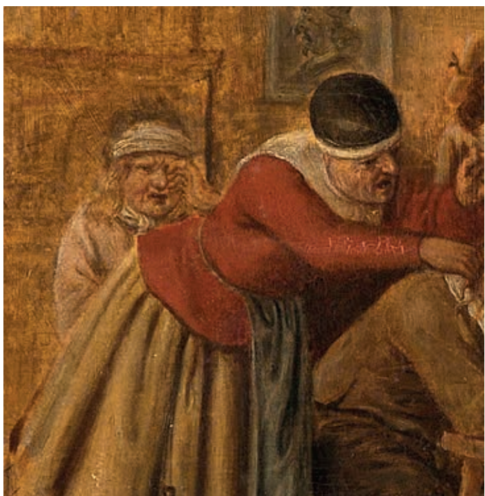
TABLE 4. Common types of dress and clothing items. 5