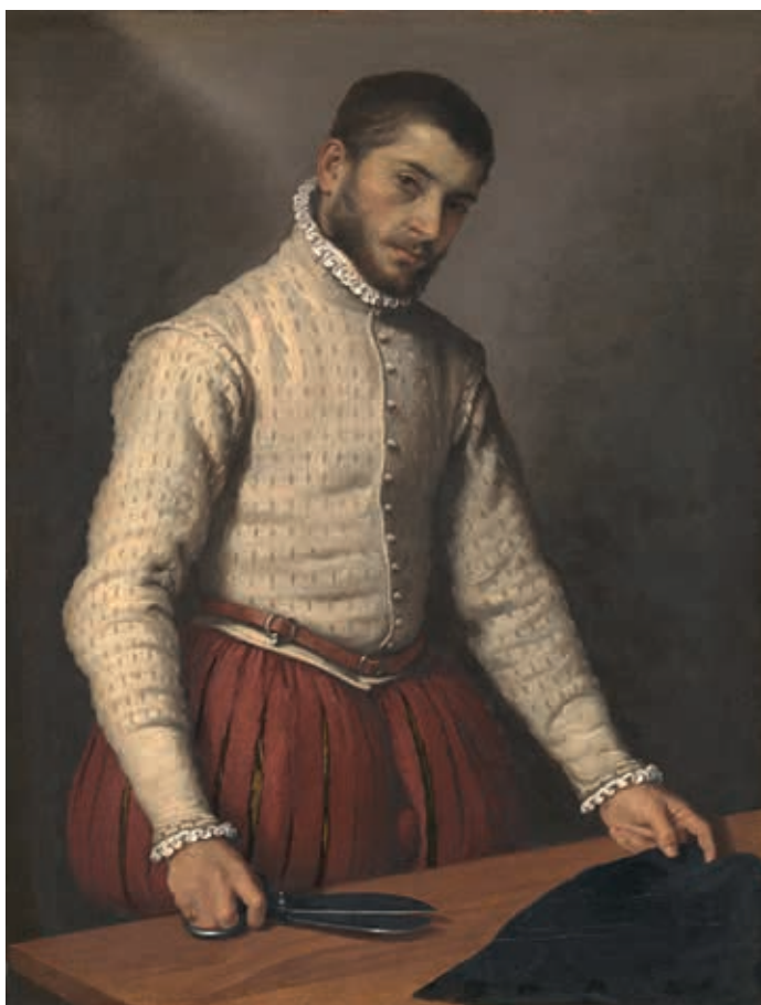
FIGURE 33. Giovanni Battista Moroni, The Tailor , 1565–1670. Oil on canvas, 99.5 × 77cm. National Gallery.

trait of a tailor by Giovanni Battista Moroni from around 1570. The pair of scissors – as a sign of his craft – reveals his occupation as a tailor (figure 33) but he does not wear practical work clothes. Instead, he is dressed in a fine cream colour pinked doublet, a pair of red slashed breeches, a fine ruffled collar and cuffs and a gold signet ring. 23