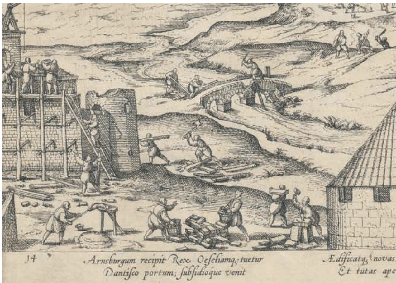
FIGURE 31. A building site. Second part of sixteenth century. Print made by Frans Hogenberg. From the book Res gestae. Friderici II. Daniae, Norvegiae, Gottorum Wandalorumque regis, ducis Slesvici, Holsatiae , published in 1589.