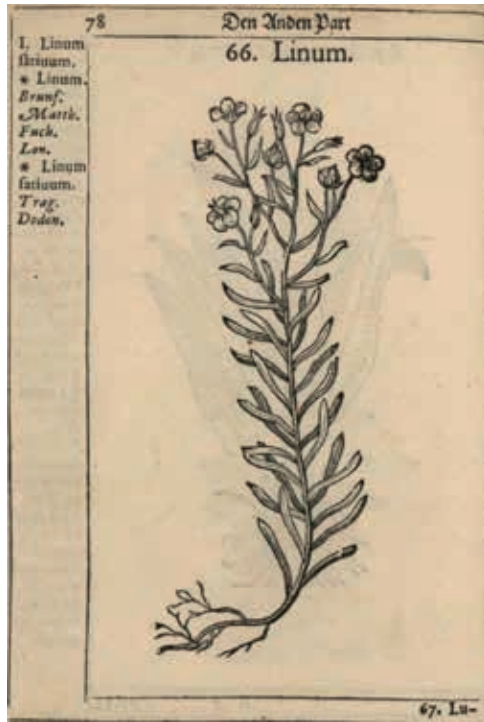
FIGURE 18. Fine woollen broadcloth. (detail) Seventeenth century. The Royal Danish Collection, Rosenborg Castle.