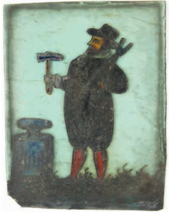
FIGURE 61. A smith wearing a black suit and a range of accessories, seventeenth century. Stained glass.

Wearing heavy velvet, fine silk or damasks, gold and silver, or fine black woolen garments, as we have already seen, provided an important way to demonstrate one's wealth and social ambitions. However, if one could not afford real velvet or fine black broadcloth, an alternative was to use their imitative versions. 73