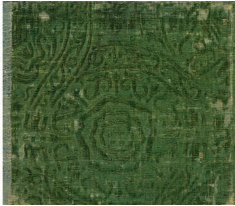
FIGURE 62. Fragments; wool, linen; H x W: 23,5 x 21.6 cm (9 1/4 x 8 1/2 in.); Gift of John Pierpont Morgan; 1902-1-366-a,b.