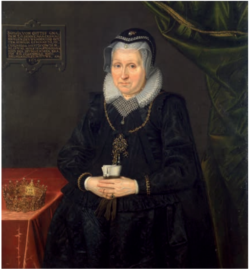
FIGURE 19. Jacob van Doordt, Sophie (1557-1631), 1626. Oil on canvas, 115 x 102 cm. The Museum of National History, Frederiksborg Castle.

lors might be newly made, but such a description could also refer to tailoring services for mending old clothes or altering them so that they were up to date with current fashions. 10