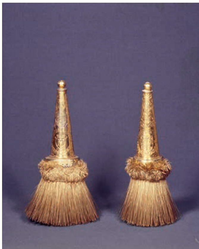
FIGURE 24. Two clothing brushes, possibly a wedding gift for Christian IV and Anna of Brandenburg. Made of gilded silver, silk and pighair. The Royal Danish Collection, Rosenborg Castle.