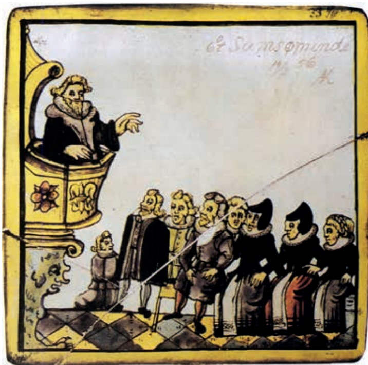
FIGURE 53. A church sermon, probably from the seventeenth century. Stained-glass window from Island of Samsø. National Museum of Denmark.

mantles, and red, grey and yellow skirts. 64 The inventory of the glovemaker Isak Clausen, for example, included some men's and numerous women's garments of these sorts: a green and a cheaper black skirt, a black and a red doublet, a cloak, a black men's suit, two old women's caps of cloth and velvet, as well as a number of white linen collars, neckcloths, aprons and linen headwear. 65