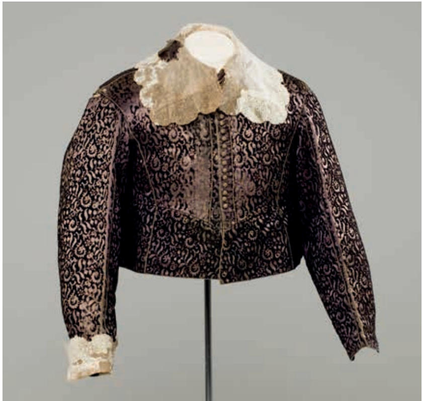
FIGURE 2. A doublet made of caffa , worn by King Christian IV at the naval battle at Kolberger Heide in 1644. The Royal Danish Collection, Rosenborg Castle.

textiles, garments and accessories ordinary Danish people owned, but also to provide a deeper understanding of how clothing mattered socially, culturally and financially at artisanal levels in early modern Denmark. Based on the previous scholarship on early modern dress, it is obvious that not just the wealthy elites but also ordinary craftspeople and their spouses adopted European fashion ideas through textiles, fine items of clothing and novel accessories. But did artisans and small shopkeepers and service providers such as butchers, barbers, smiths and tailors and their wives in early modern Denmark enjoy a similar material wealth as for example in Italy?