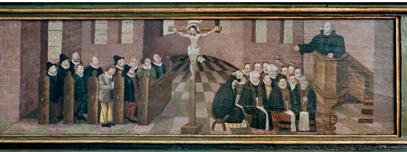
FIGURE 52. A church sermon, probably second part of the sixteenth century. Painted on the platform of the altar in Tinglev Church. National Museum of Denmark.