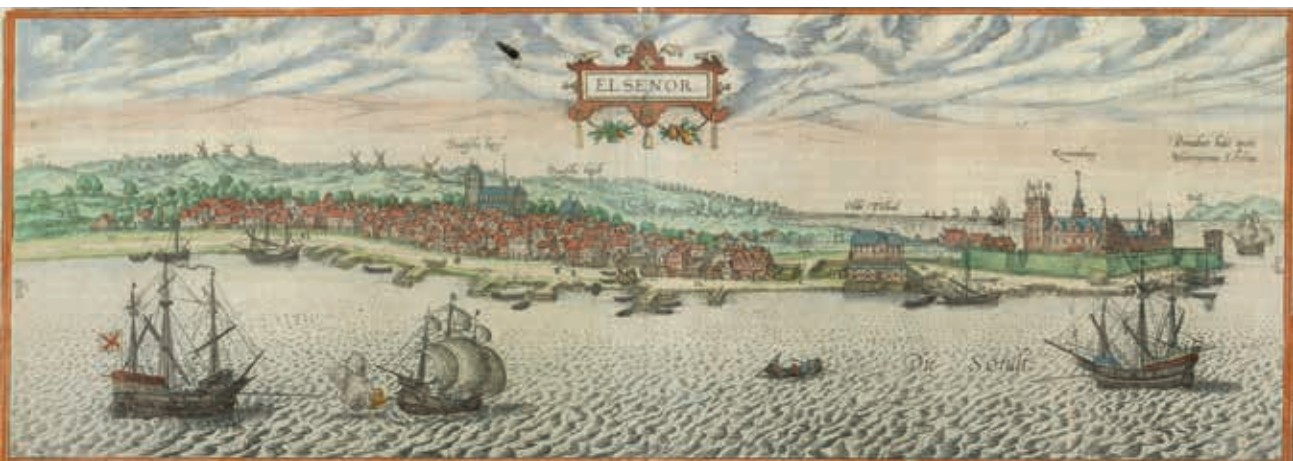
FIGURE 4. Georg Braun, Frans Hogenberg, Simon Nouellanus, Prospect of Elsinore , 1612-1618. Hand-coloured engraving. Royal Library of Denmark.

tian IV established several metalworks outside and in the centre of Elsinore, where a foundry was established in 1599. These industries were important for the kingdom, because they provided canons for the military and bells for churches in Denmark. Even more than this, the industries attracted specialised artisans working in the building and metal trades. 54