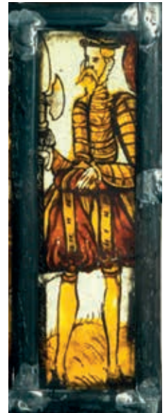
FIGURE 43. Master shoemaker Jesper Pedersen, dressed as a town guard (detail of figure 34). Museum Odense.

Garments that had a connotation of soldiers, such as tight-fitting leather cassocks, doublets, jerkins or breeches, were popular, since they signalled male strength and gave the wearer extra protection that was also useful in civilian life. 134 A number of artisans owned leather buff-coats, of plain leather, cordo-