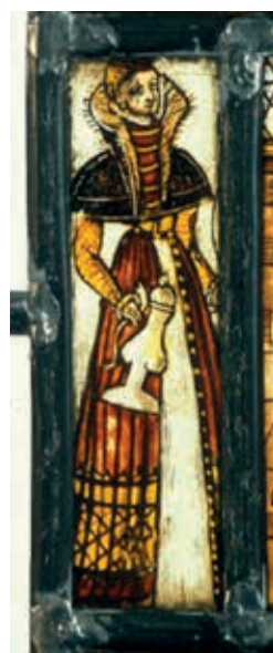
FIGURE 46. Master shoemaker Jesper Pedersen's wife wearing a fur-lined black cape (detail of figure 34). Museum Odense.

Sumptuary laws sometimes mention fur. A law issued in Ribe in 1561 stated that servant maids were banned from wearing short mantles in marten or ermine, a white spotted luxury fur usually associated with elites and roy-