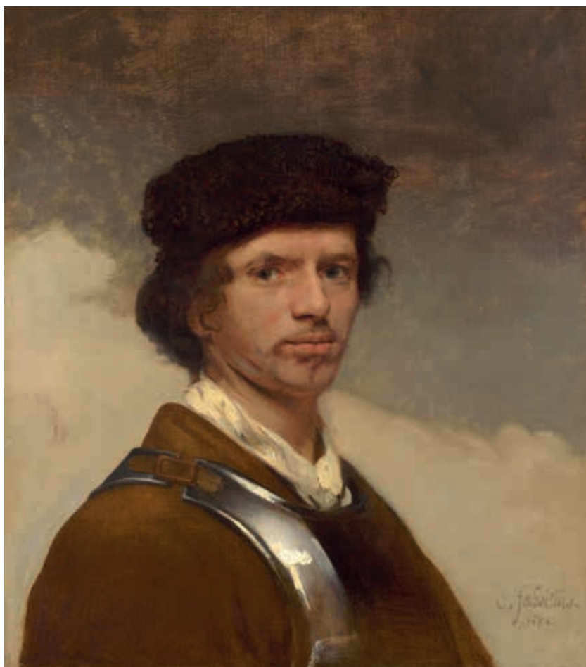
FIGURE 48. Carel Fabritius, A Young Man in a Fur Cap and a Cuirass (probably a Self-Portrait) , 1654. Oil on canvas 70.5 × 61.5 cm. National Gallery London.