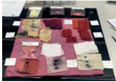
FIGURE 26. Results of stain removal experiment based on a recipe with chanterelles.

and oil from silks, carried out by the Refashioning the Renaissance at Aalto University in 2019 showed that the recipe for cleaning spots with a solution of chanterelles and water had little effect. Instead, it turned the white fabric yellow (figure 26). 91