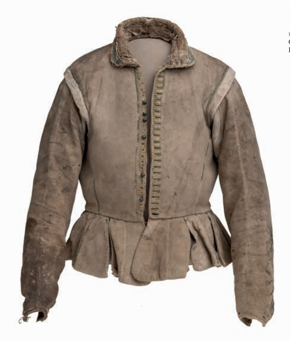
FIGURE 32. Hugo de Groot's leather doublet. Rotterdam Museum.