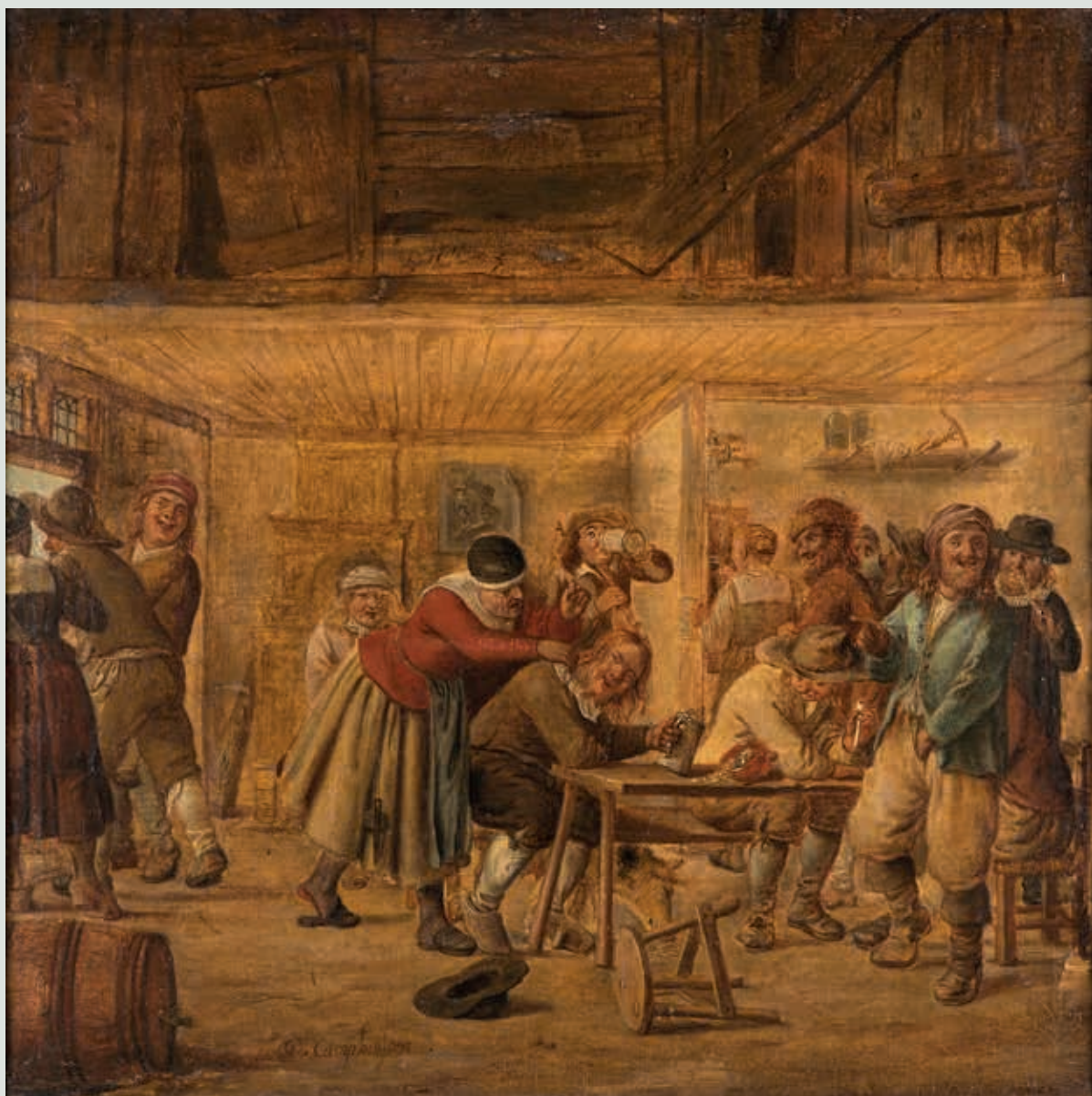
FIGURE 7. Govert Camphuysen, Town Inn , 1664–1665. Oli on canvas, 47x47 cm. Malmoe Art Museum.