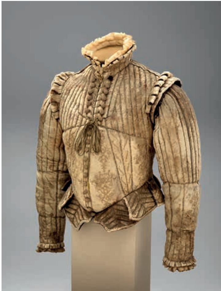
FIGURE 49. Fencing doublet of leather and embroidery of silk, gold and silver ca. 1580. Metropolitan Museum of Arts.