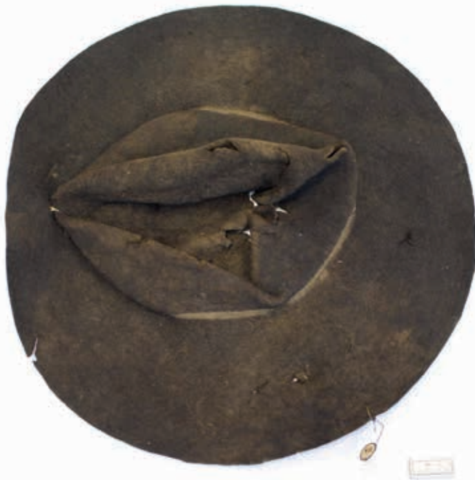
FIGURE 16. A felted hat. Late seventeenth century. Excavated from Rådhuspladsen in Copenhagen.

Headwear was a particularly significant feature of artisanal dress. According to the early modern historian Evelyn Welch, hats were a way to construct ‘visible communities’ and to express status, connection, superiority or subordination. 52 Whether made of wool, fur, rich silk or linen, caps were essential for an artisan’s outfit both on everyday and fine occasions. 53 Black, grey or brown hats, some of them felted, seem to be especially suited to fine occasions. 54 A black felted hat was listed among the clothes of the kettlesmith named Oluf Tygesen. This could have been similar to the surviving felted hat excavated from the underground of Rådhuspladsen in Copenhagen (figure 16). 55