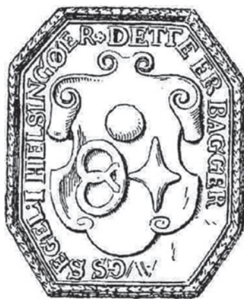
FIGURE 55. The guild seal of the Elsinore bakers’ guild. Published in Tidsskrift for Kunstindustri , 1897.

His status in the trade is also suggested by the way he and his wife had dressed when he was still alive. Accord-