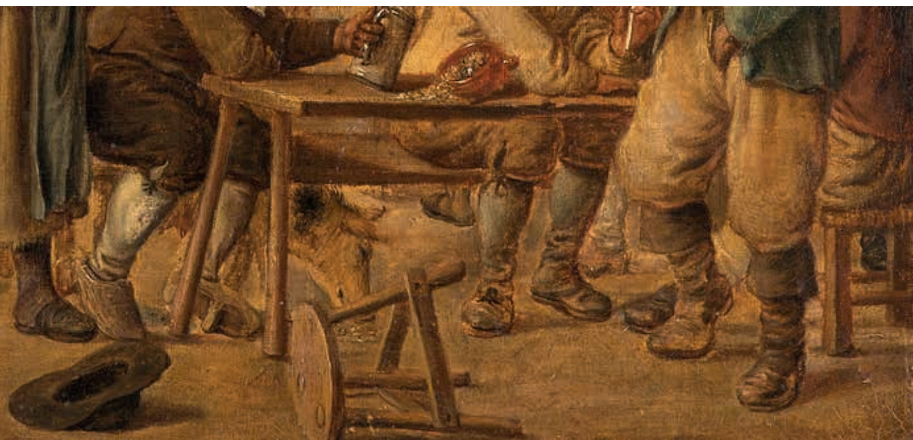
FIGURE 13. Govert Camphuysen. Town Inn , 1664-1665. (detail) Malmoe Art Museum.

brown woollen cloth, another from coarse linen, which he could wear with his red woollen waistcoat, a linen collar and a hat. 33