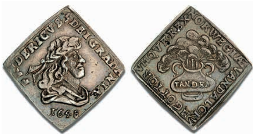
FIGURE 40. Throwing coins from the coronation of Frederik III in 1648. The Royal Danish Collection, Rosenborg Castle.

in 1648. This indicates that he might have been present at the king's coronation in Copenhagen (figure 40). 99