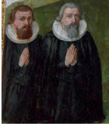
FIGURE 15. Mayor of Horsens Anders Jørgensen. First part of seventeenth century. Painted epitaph from Horsens Abbey Church (detail).

and colours of clothes. 41 For instance, the inventory of the turner Axel Drejer listed one blue underskirt, which could have been worn underneath the other black, brown or grey skirts mentioned in the inventory. 42