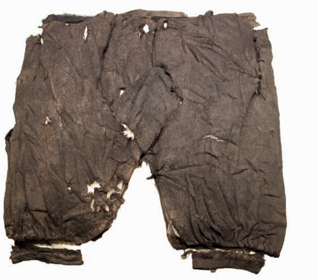
FIGURE 28. A pair of mended breeches, seventeenth century. From the excavation of Rådhuspladsen in Copenhagen.

tical garments used daily made out of coarse and practical canvas or rough linen were often repaired several times to extend their use. Two linen shirts found among the goods of the modest cobbler's wife Else Mogensdatter were, for instance, patched; 110 while the young miller journeyman Abraham Ber had a pair of relatively cheap patched everyday breeches of canvas – probably worth little. However, such items retained enough value to be donated to 'a poor thing', as becomes clear from his inventory. This shows that even worn-out garments were always worn by someone. 111 An extant pair of patched breeches from the seventeenth century, likely of coarse wadmol, excavated from Rådhuspladsen in Copenhagen, gives a sense of what mended and heavily worn-out breeches looked like (figure 28). 112