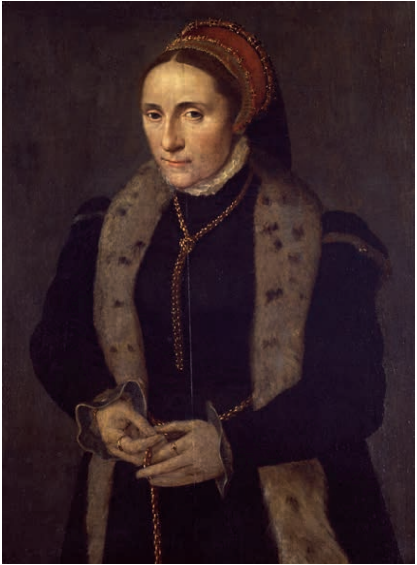
FIGURE 47. Unknown artist, Christine (1521-1590), ca. 1570. Oil on wood, 61 x 44 cm.