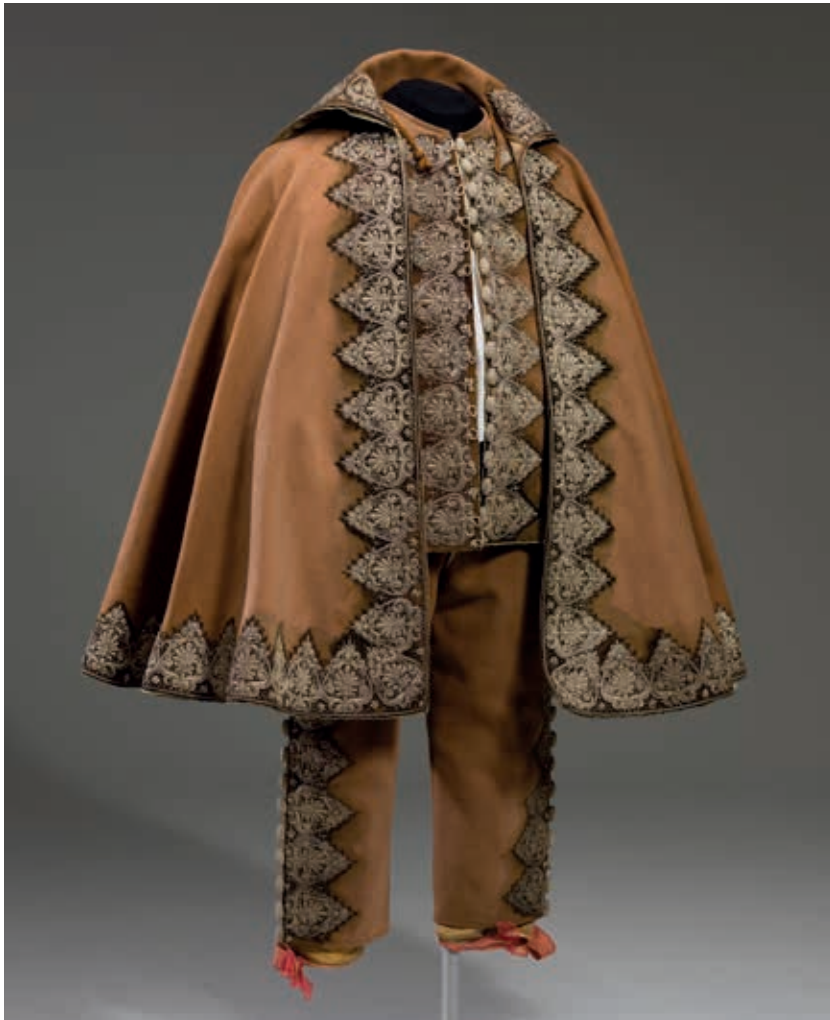
FIGURE 6. Prince Elect Christian's liver brown suit made of fine broadcloth. Seventeenth century. The Royal Danish Collection, Rosenborg Castle.

Despite the high level of detail in artisan inventories, it is also challenging to identify what artisanal people in Denmark actually wore. Even though