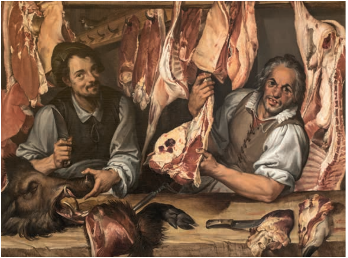
FIGURE 41. Inv. 1936. Bartolomeo Passerotti, The Butcher's Shop . Oil on canvas 112 x 152 cm. Gallerie Nazionali di Arte Antica. Palazzo Barberini.

moral virtues such as sobriety, since woollen fabrics were not as reflective in light as silk, which was considered festive. 105 Thus, by wearing black overgarments such as mantles or cloaks, artisans and their wives were linked with urban dress codes such as respectability, dignity, self-possession and honesty, but also civility. 106 The Englishman Fynes Morrison noted that 'going out of the house they [Danish women of all ranks, married or unmarried] have the German custome to weare cloakes'. 107 By wearing a cloak, women associated themselves with good morals and honesty. 108 Not being able to wear a cloak could distress both women and men. In 1632, numerous journeymen complained about the journeyman Christoffer Hoffmann, who had in a rage called them nicknames when they took his mantle as a pawn due to his debts to the guild. 109