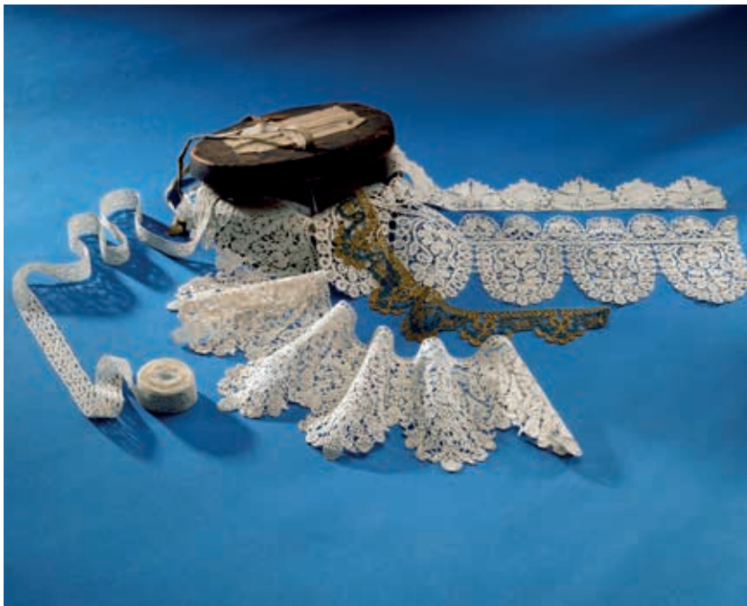
FIGURE 23. Band box with samples of bobbin lace. Britain, seventeenth century. Victoria and Albert Museum, London.

Garments made of other materials than linen, such as wool, silk, leather or fur, were not washable in the same way as linen garments. Woollen and silk garments dyed with natural dyes or finished with glazing or hot-pressing techniques in particular could not be immersed in water and scrubbed in the same way as linen, hemp or cotton. Another way to freshen clothes of wool, silk, fur or leather was to air them between wearing. 85 Dirt could also be removed from garments made from heavy woollens, fine silks and decorations by brushing the clothes with clothing brushes. 86 The organ builder Johan Lorentz, a citizen of Copenhagen and appointed in 1649 by Christian IV to rebuild the organ in St. Olaf church in Elsinore (unfortunately, he died