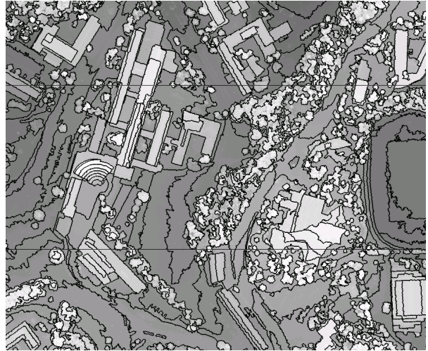
Figure 2. Segmentation result overlaid on the DSM. The size of the subarea shown in the figure is 450 m x 540 m.

Segmentation and classification results for part of the study area are shown in Figures 2 and 3, respectively. Figure 4 shows change detection results for the entire study area. It is a combination of buildings presented in the old map and buildings detected from the laser scanner data. At first, new and enlarged buildings from the classification result were plotted. Buildings of the old map were then overlaid. The figure thus shows the shape and location of old buildings as they appear in the map and the shape and location of new buildings as they were detected from the laser scanner data.