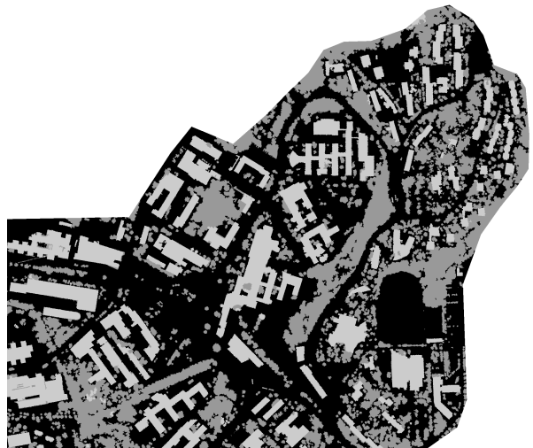
Figure 3. Classification result (Light grey: building, Dark grey: tree, Black: ground surface). The size of the subarea shown in the figure is about 1.1 km x 1.3 km.

To obtain information on the accuracy of the results, buildings detected from the laser scanner data were compared with buildings of map 2. Buildings used as training objects in rule determination and new buildings not presented in map 2 were excluded (see Section 2.3). The comparison was first made by comparing the classification result with the raster map pixel by pixel. Two measures were calculated: