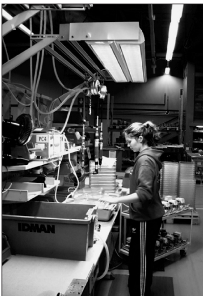
Figure 1: One of the workstations in the study area.

The products assembled were different for the different workstations, but the tasks that had to be performed were similar for all workers. Subjects put together luminaire components such as a frame, the gear, and optical parts, and sometimes a cover. Connecting the wires was the most visually demanding part of the work. The tasks were mainly in the horizontal plane. For this kind of work the European standard EN 12464-1 (2.6 electrical industry, 2.6.2 assembly work, medium) requires 500 lux (maintained illuminance).