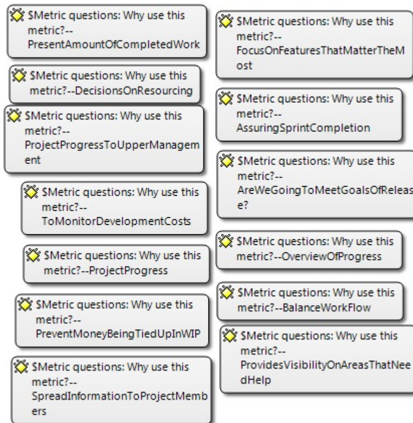
Figure 3.1: Reason for metric use category named 'Progress tracking' was formed by organizing descriptive codes in to a group based on their similarity